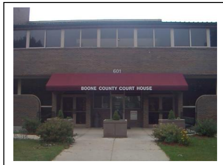
Boone County Courthouse 601 North Main Street Belvidere, Illinois 61008