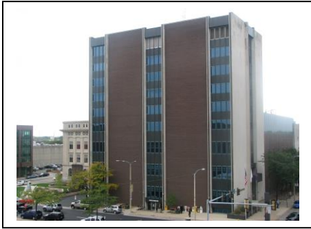
Winnebago County Courthouse 400 West State Street Rockford, Illinois 61101