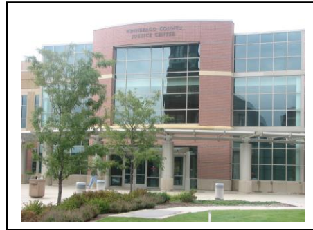
Winnebago County Criminal Justice Center 650 West State Street Rockford, Illinois 61102