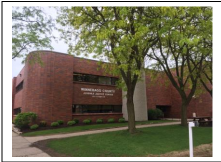
Winnebago County Juvenile Justice Center 211 South Court Street Rockford, Illinois 61101