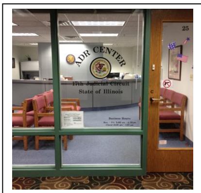
Alternative Dispute Resolution Center 308 West State Street, Suite 25 Rockford, Illinois 61101