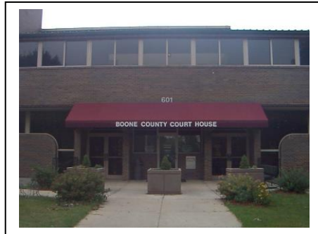
Boone County Courthouse 601 North Main Street Belvidere, Illinois 61008